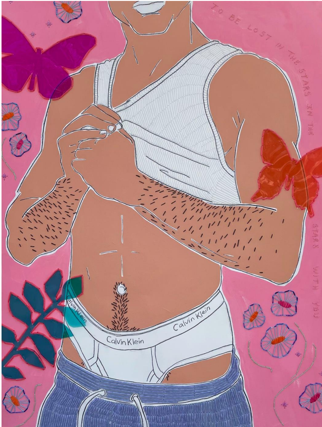
To be Lost in the Stars with You (Spring Blossoms) acrylic, graphite, embroidery floss, yarn on Paper 39.5"x30.5" Shadowbox frame in white $4,300.00