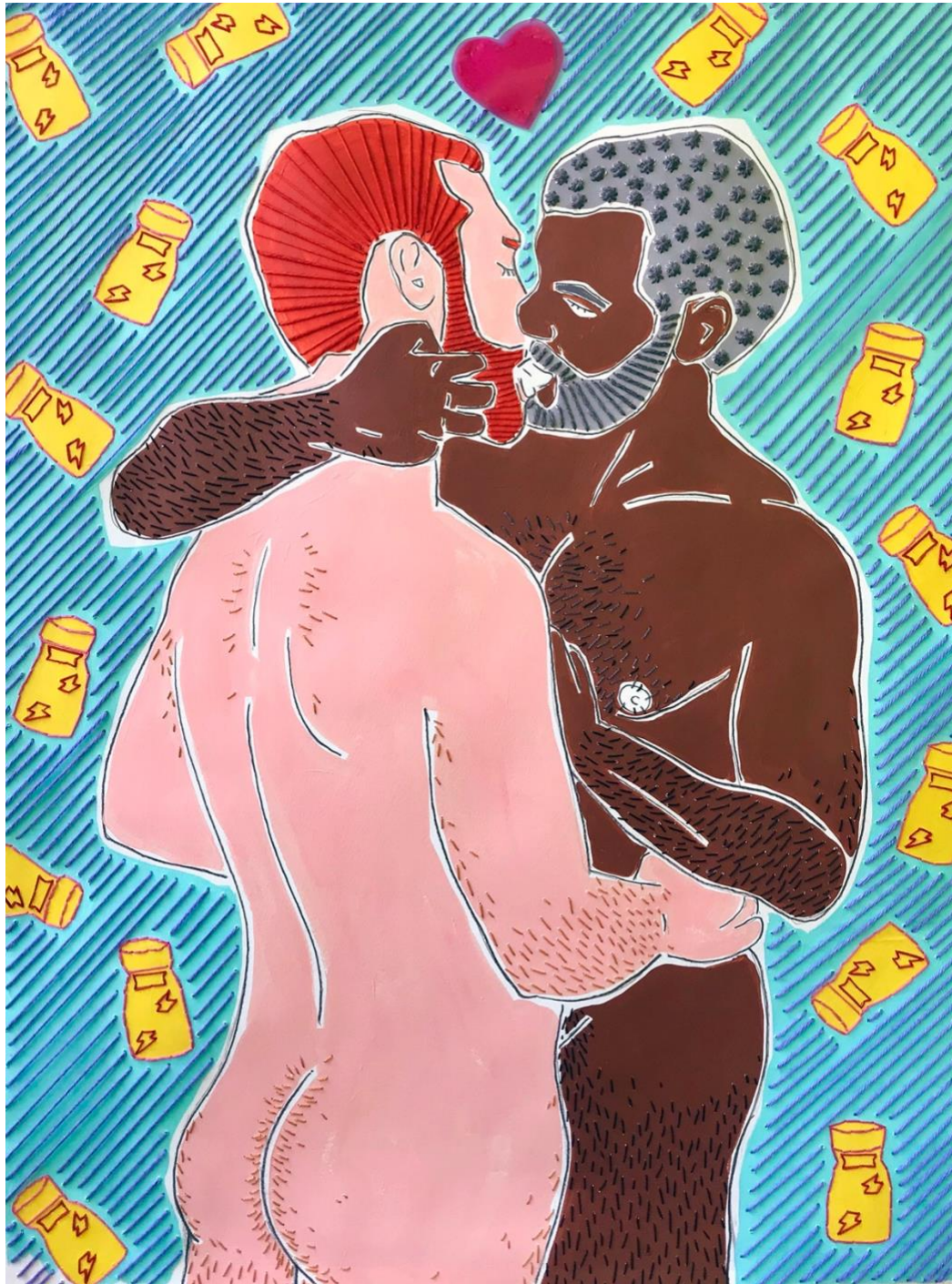
Love Rush (Enter Deep) acrylic, graphite, embroidery floss, yarn on Paper 39.5"x30.5" Shadowbox frame in white $5,000.00