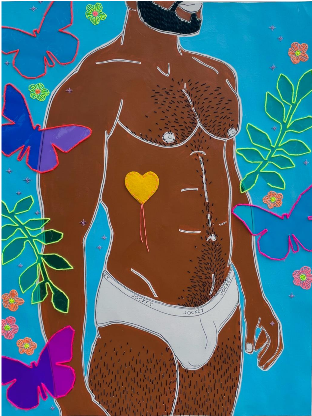
A Lover in a Field of Fluorescents (Zack in White Jockeys) acrylic, graphite, embroidery floss, yarn on Paper 39.5"x30.5" Shadowbox frame in white $4,300.00