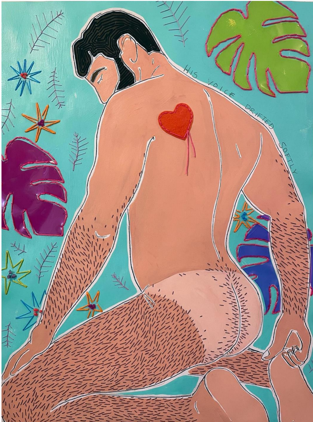
His Voice Drifted softly (Elias Waits by the Monstera Deliciosa) acrylic, graphite, embroidery floss, yarn on Paper 39.5"x30.5" Shadowbox frame in white $4,500.00