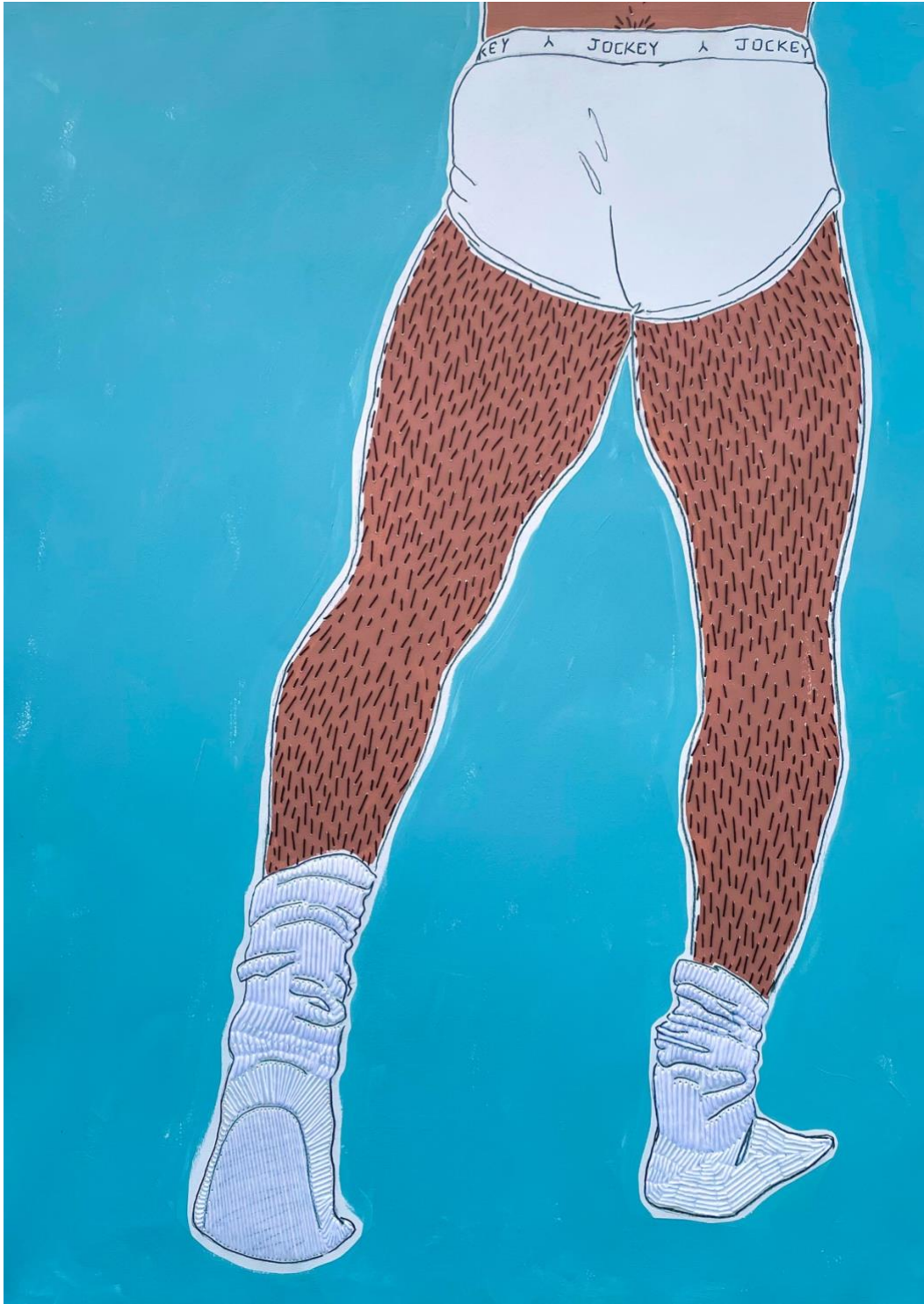
He moves softly in the morning (Renato in his jockeys) acrylic, graphite, embroidery floss, yarn on Paper 39.5"x30.5" Shadowbox frame in white $3,200.00