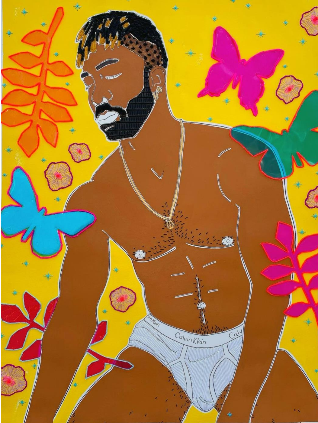
Middy Conversations Drawing Constellations (His Sun in Cancer) acrylic, graphite, embroidery floss, yarn on Paper 39.5"x30.5" Shadowbox frame in white $5,000.00