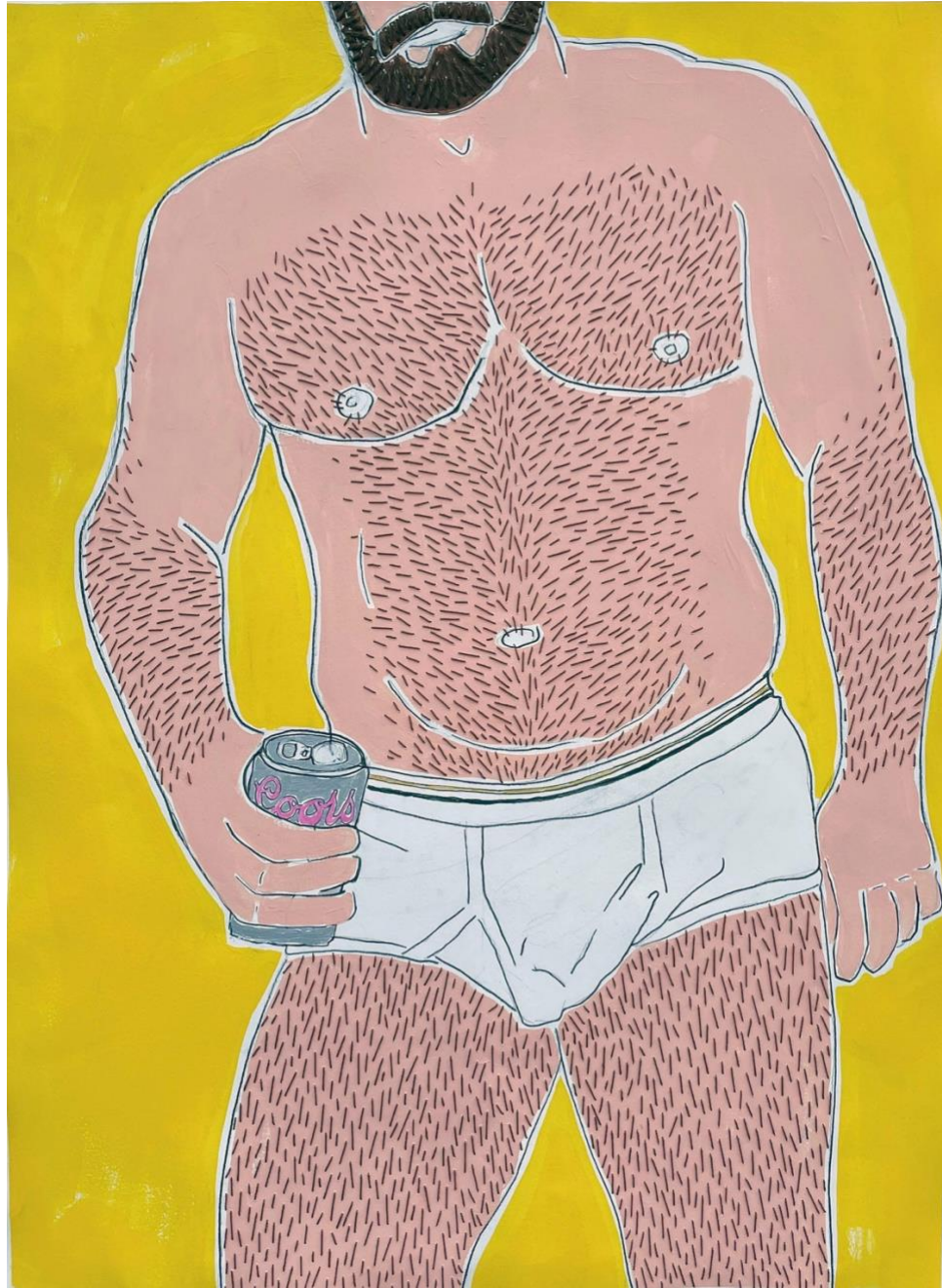
An Invitation (Beer Can thick in Stafford briefs) acrylic, graphite, embroidery floss, yarn on Paper 39.5"x30.5" Shadowbox frame in white $3,800.00