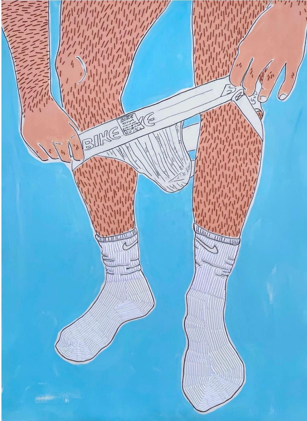
Sports (Suit up/Suit On) acrylic, graphite, embroidery floss, yarn on Paper 39.5"x30.5" Shadowbox frame in white $3,200.00