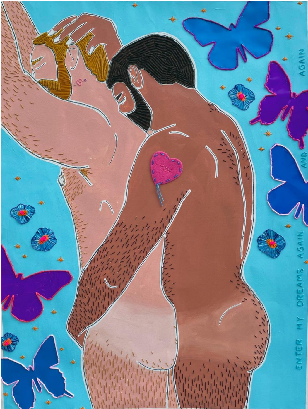
Enter My Dreams Again and Again acrylic, graphite, embroidery floss, yarn on Paper 39.5"x30.5" Shadowbox frame in white $4,300.00