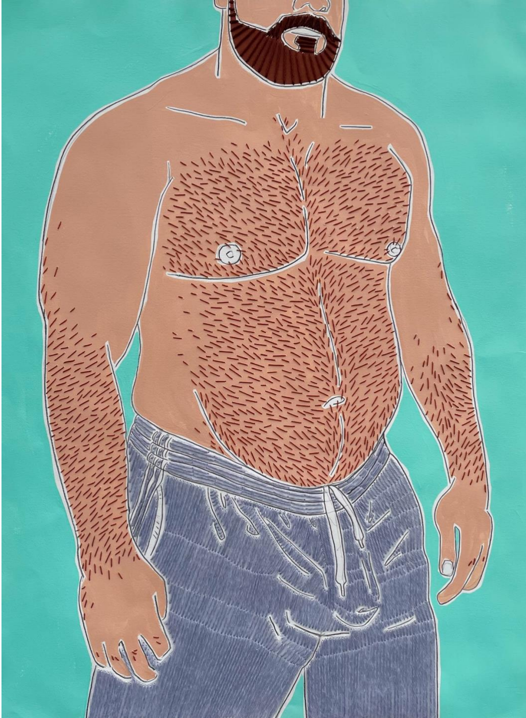
Coach in Gray Sweats (Ready for your Warmup Drill!) acrylic, graphite, embroidery floss, yarn on Paper 39.5"x30.5" Shadowbox frame in white $3,800.00