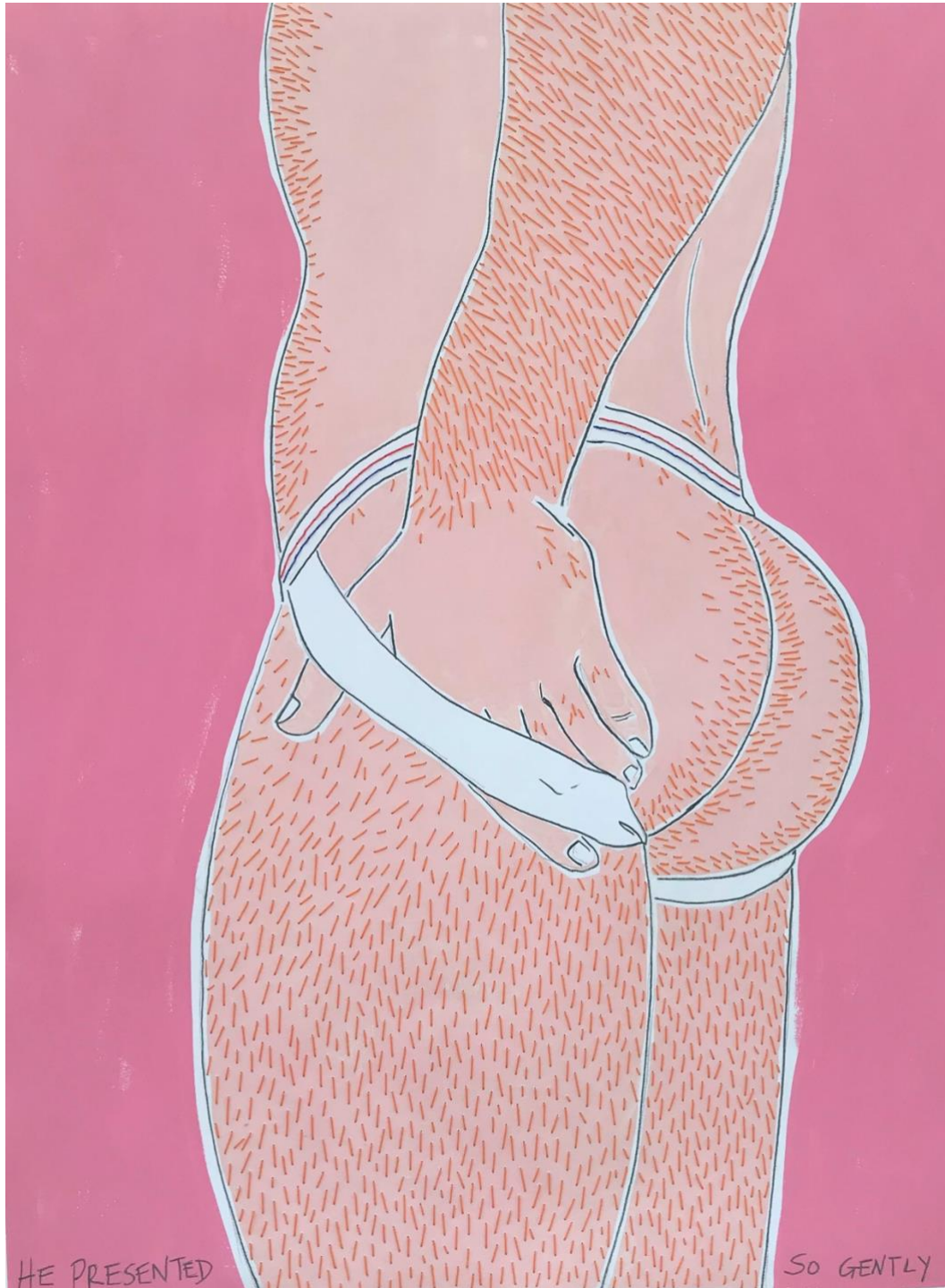
He Presented so Gently (Ginger in Jock) acrylic, graphite, embroidery floss, yarn on Paper 39.5"x30.5" Shadowbox frame in white $3,300.00